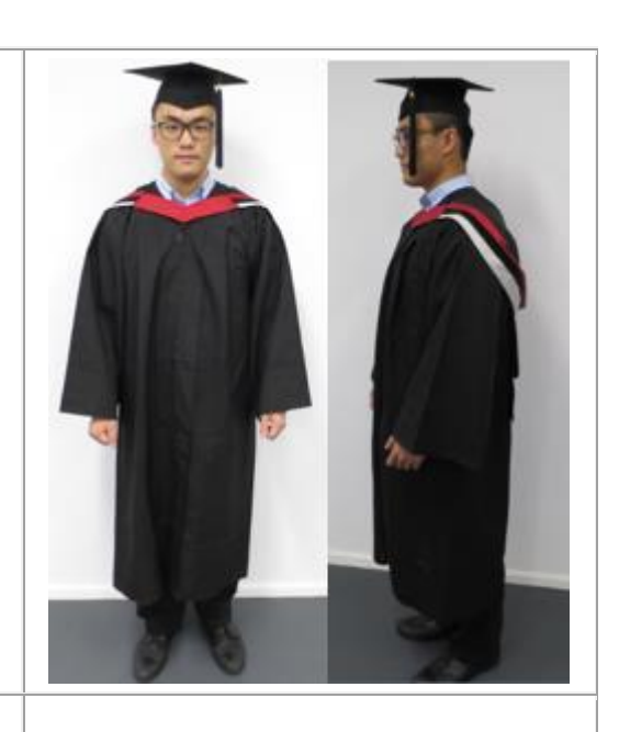
男同學宜穿著襯衫, 西褲, 黑色皮鞋。

Female students are suggested to wear shirts, trousers / formal skirts, and black leather shoes.